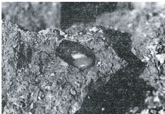
FIGURE 1. Cell of Leioproctus fulvescens (Smith), showing a larva lying on a pollen mass. Dillons Point, Blenheim. 8 January 1980.

Natural nest sites of Colletinae are bare and semi-bare areas of ground that are free of excess moisture during the nesting season, and in which the substrate is of such a consistency that nests can be excavated without difficulty. Nests consist of branching tunnels which at a depth of about 200-500 mm terminate in oval cavities (cells). Strong preferences for certain physical features of nest sites are exhibited by some species. Leioproctus metallicus (Smith) nests only along the upper ocean beach line in dry, shifting sand or fine gravel in areas that are inundated by spring tides (Fig. 2).