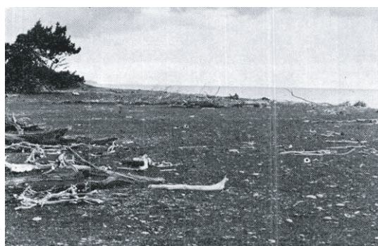
FIGURE 2. Nest site of Leioproctus metallicus (Smith) in the sandy upper beach at Conway Flat, North Canterbury. 22 December 1977.