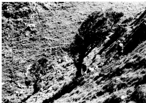
Figure 3: Kaikomako Valley bottom showing surface stones, extant kaikomako trees and occasional tauhinu shrubs; a probable site for initial revegetation (October 1986).

Revegetation can begin on valley bottoms and sides where there is most moisture and shelter (Fig. 3). Wind breaks can be established with groups of plants, particularly those resilient to wind, eg, flax ( Phormium spp.), ngaio ( Myoporum laetum ), taupata ( Coprosma repens ) and akeake ( Dodonaea viscosa ). These clumps will provide shelter and a seed source for further regeneration. Spot planting with kanuka, manuka, akeake and other early successional trees would provide further seed sources. Concurrently, some areas will be left to establish a woody cover from natural seed dispersal and such areas should be monitored. In addition, selected seed, appropriate for the stage of vegetation development, can be scattered at times to ensure best germination, for example, species such as karaka, kohekohe and tawa ( Beilschmiedia tawa ). Frugivorous birds and reptiles will also distribute seeds.