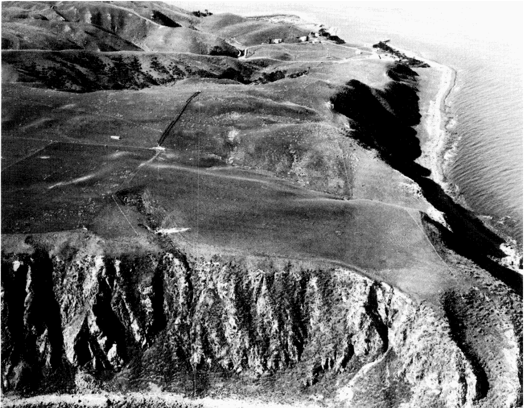
Figure 2: Aerial view of the southern part of Mana Island; steep southwestern coastal cliffs in the foreground, flat grassy plateau top in the middle ground, dissected by valleys in the background. The old farm buildings, manager's house and wharf can be seen in the top right of the photograph. Sheep are visible since the photograph dates from 1976.

The soils are silt loam or fine sandy loam in texture, imperfectly drained on the plateau and well-drained elsewhere. Their low to moderate natural fertility has been evaluated by topdressing and use of the island by stock.