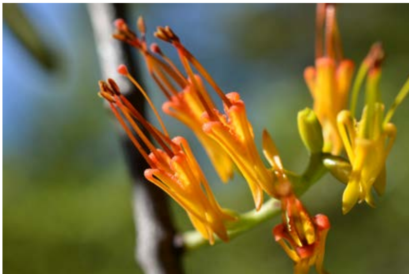
Flowering Alepis flavida at Craigieburn Forest Park.

Ngā mihi o te Kirihimete me Te Tau Hou (Merry Christmas and Happy New Year).