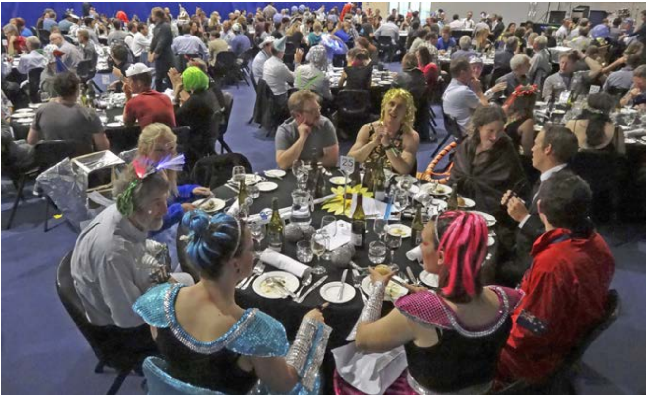
The 2014 Water Symposium conference dinner was "out of this world".

The next New Zealand Freshwater Sciences Society will be held in Wellington in 2015, and will be a joint conference with the Australian Limnological Society. Hopefully in future years we will see a joint conference with NZES and NZFSS!