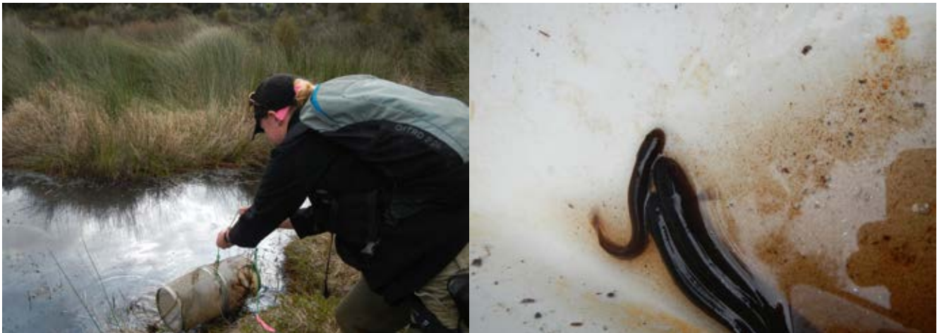
Sarah from Auckland Zoo removes one of the traps and inspects her catch, 3 mudfish caught in one trap.

While mudfish were found to be absent at two of the wetlands investigated, by the time all the live capture traps had been retrieved the following day from the third wetland, nine mudfish had been found much to the delight of those involved.