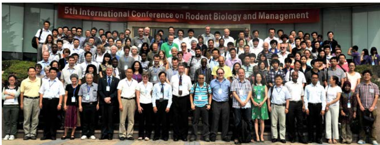
5ICRBM conference delegates in front of Glory Hotel, Zhengzhou