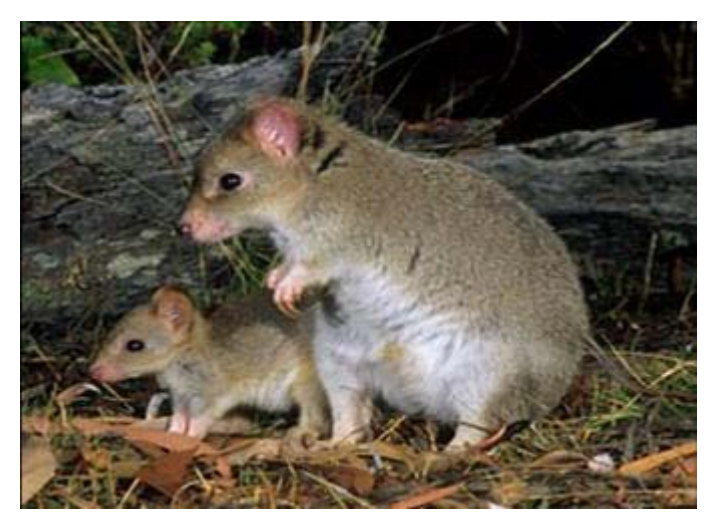
The truffle-eating Tasmanian bettong is being reintroduced to Mulligan's Flat.

Overall, although New Zealand ecosystems are generally more mesic than the Australian, I was reminded of how ecological principles still hold across ecosystem types, how much we have in common with our Australian neighbours, and how much we could learn from each other. The two societies hold a joint conference every 4 years, but I urge the New Zealand Ecological Society to explore ways to foster further regular interactions with our neighbours, and would encourage New Zealand ecologists to sample the Australian annual conference occasionally; especially if you like lamingtons for morning tea.