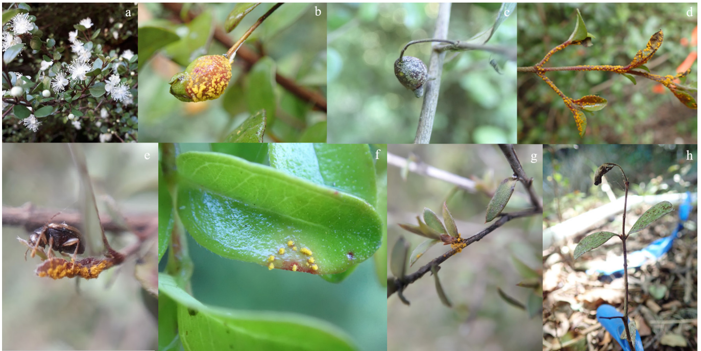
Figure 1 Austropuccinia psidii (myrtle rust) infection in monitoring site A. Flowering Lophomyrtus sp., December 2018 (a), Lophomyrtus sp. infected fruit, January 2019 (b), dry Lophomyrtus sp. fruit with old myrtle rust infection, April 2019 (c), infected Lophomyrtus sp. shoots, January 2019 (d), bronze beetle Eucolaspis brunnea feeding on infected Lophomyrtus sp. leaves (e), infection on Metrosideros diffusa , March 2019 (f), infection on Leptospermum scoparium , October 2018 (g), dieback on a Lophomyrtus seedling from myrtle rust infection, February 2019 (h).