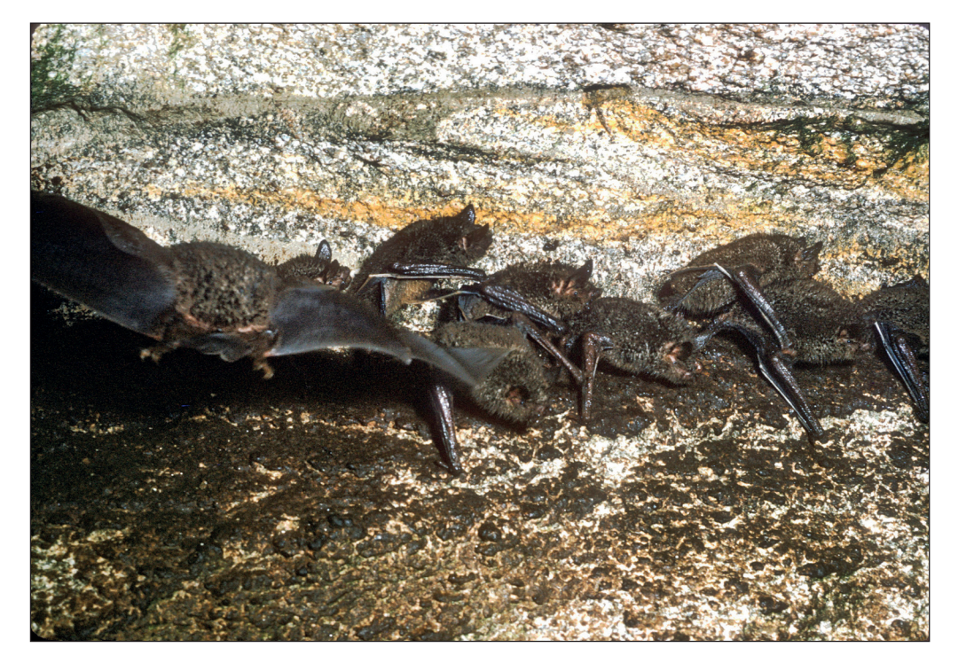
Figure 3. Greater short-tailed bats ( Mystacina robusta ) in the "bat cave", Big South Cape Island/Taukihepa, April 1961.

In 1998, an oil spill from the tanker Command occurred on the Californian coast and killed thousands of seabirds including an estimated 32,000 titi (Moller et al. 2003; Bellingham et al. 2010; McClelland et al. 2011). Eleven titi were recovered on beaches including one banded on Whenau Hou (Codfish Island). The discovery of this bird allowed Rakiura Māori and Otago University to apply for mitigation funding through the Command Oil Spill Trustee Council . With the assistance of Oikonos Ecosystem Knowledge , funding was received to study the productivity of titi and sustainability of muttonbird harvesting (under the Kia Mau Te Tītī Mo Ake Tōnu Atu project) and to restore privately owned islands through the eradication of rats, which was overseen by the non-profit group, Ka Mate Nga Kiore (Moller et al. 2003; Moller et al. 2009; Bellingham et al. 2010; McClelland et al. 2011). The