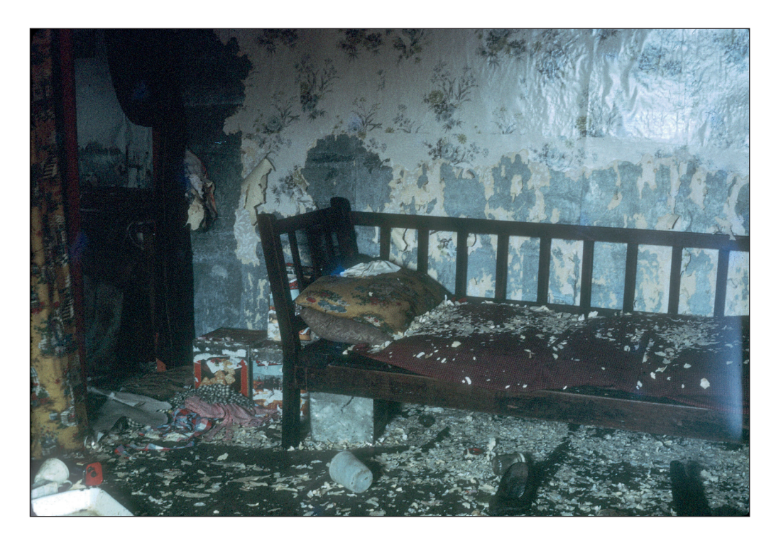
Figure 2. Damage by ship rats ( Rattus rattus ) to the Waitiri family muttonbird hut on Big South Cape Island/Taukihepa, April 1964.

et al. 2016), supporting this origin hypothesis.