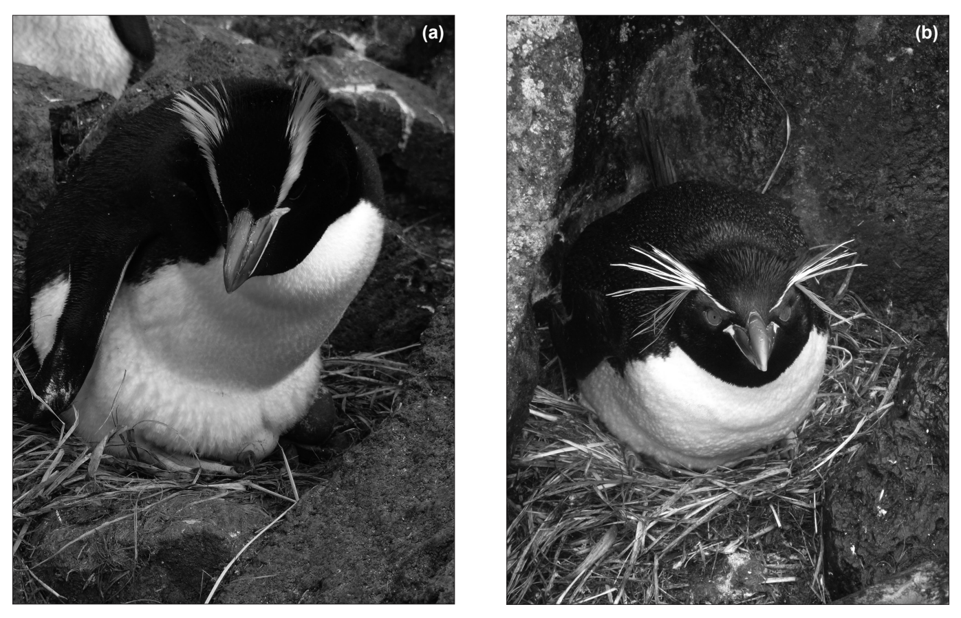
Figure 2. (a) Erect-crested penguin, Eudyptes sclateri and (b) rockhopper penguin E. filholi on nests.

this searching of boulder fields could take up to 25% of the count time. For erect-crested penguins, only nests with birds securely on the nest or standing beside a nest with an egg in the nest were counted. Those standing beside a nest without an egg were not counted because the nesting season for erect-crested penguins begins in late September and if penguins had not laid by late October – early November they were unlikely to nest. Small colonies were counted in one block, while larger colonies were divided into elongate smaller blocks, the totals for which were then added together; stock-marker spray paint was used to divide up blocks. Only one person counted a block at a time, to minimise disturbance to the nesting birds. All preparations for a count were made away from the colony to reduce disturbance.