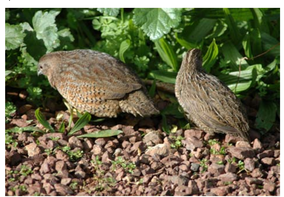
Australian brown quail (Coturnix ypsilophora).

This article has been abridged, the original article previously appeared in Dawn Chorus, the magazine of the Tiritiri Matangi Supporters.