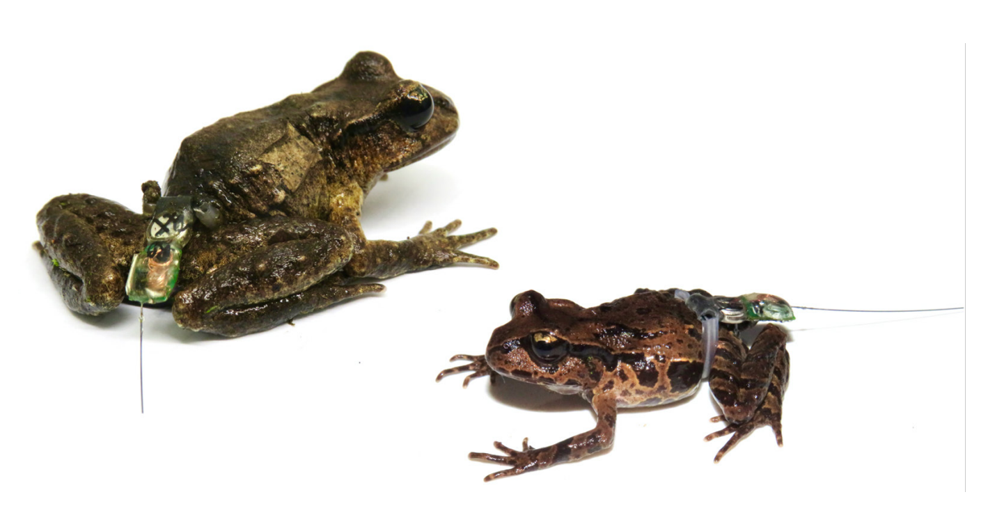
Figure 1. An adult Hamilton's frog ( Leiopelma hamiltoni ) (left) with a telemetry harness attached next to an adult Archey's frog ( L. archeyi ), (right) with telemetry harness attached.