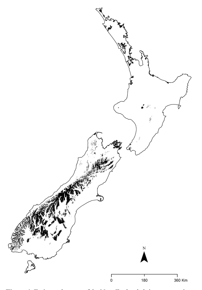
Figure 1. Estimated extent of the New Zealand alpine zones using ArcGIS for Desktop Spatial Analysis Tools. Spatial extent was estimated by creating a minimum height raster based broadly on a regression in treeline altitude of -100 m elevation for every degree in latitude southwards, starting at 2100 m.a.s.l. at the northern tip of the North Island (Cieraad & McGlone 2014). A 25 metre digital elevation model (DEM) provided by Landcare Research NZ with the minimum height raster was then overlaid to find all areas where the DEM value was above the minimum height value. The resulting area was extracted to a polygon, extracting the following land cover areas provided from the NZ Land Cover Database (LCDB v 4.1): Permanent snow and ice, gravel or rock, landslide, alpine grass/herbfield, sub alpine shrubland, and tall tussock grassland.

alpine zone, tall tussock species give way to shorter grasses, dwarf shrubs and cushion or turf-forming herbs in fellfields; growth forms indicative of the high alpine zone (Mark & Dickinson 1997). As a consequence of relatively recent rapid tectonic activity and glaciations, phylogenetic radiations of plants and animals have been extensive in the alpine zone, especially among plant and invertebrate communities, but including reptiles and birds (Wallis & Trewick 2009). Floral diversity throughout the alpine zone is high, with >600 species of vascular alpine plants, the majority of which (c. 93%) are endemic (Mark & Adams 1995).