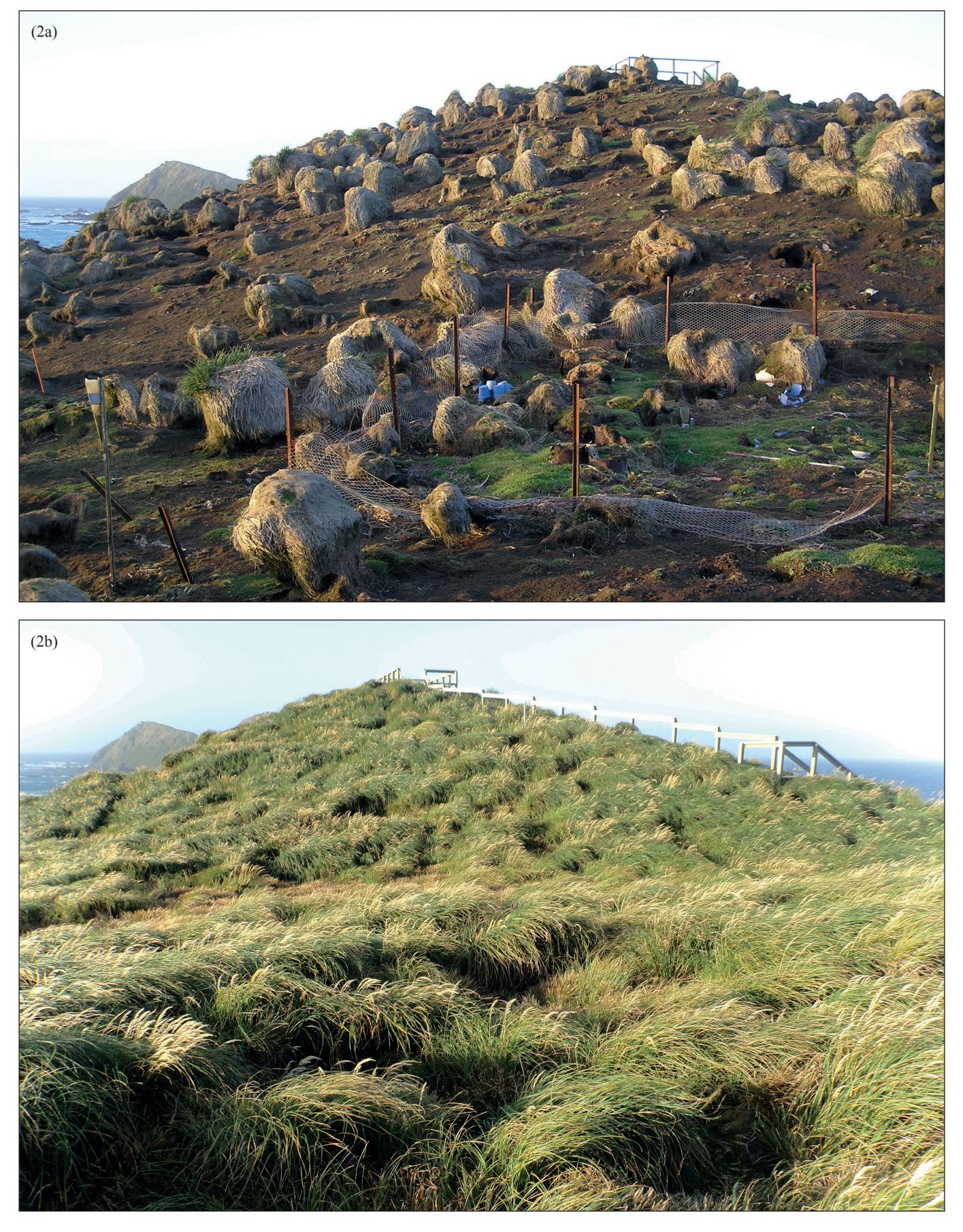
Figure 2. Razorback Spur at the base of The Isthmus on Macquarie Island, 54°30'17.92"S, 158°55'50.91"E. Photos taken April 2005 (2a) prior to and March 2014 (2b) since the removal of invasive rabbits illustrate the scale of vegetation recovery underway in the absence of grazing animals.