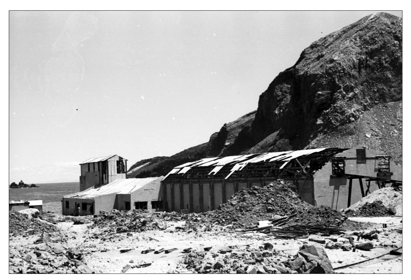
Figure 1. The abandoned sulphur factory on White Island, November 1949, where Wodzicki trapped and identified kiore.

In January 1950, I accompanied Charles Wright (of DSIR's Soil Bureau), Peter Bull and others on the first of a series of ecological surveys (Bull 1952) in the region lying to the west of Lake Taupo (Figure 3). In those days, the country from the road between Tokaanu and Taumarunui north to Tihoi, and west to the summit of the Hauhangaroa Range was all